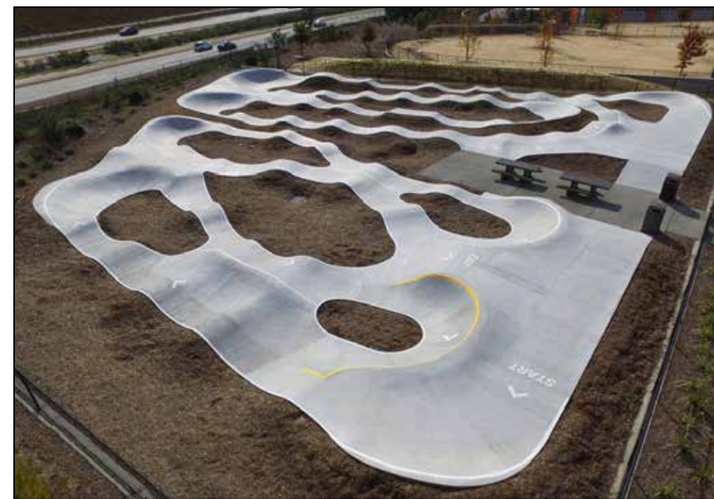
CONCRETE PUMP TRACK