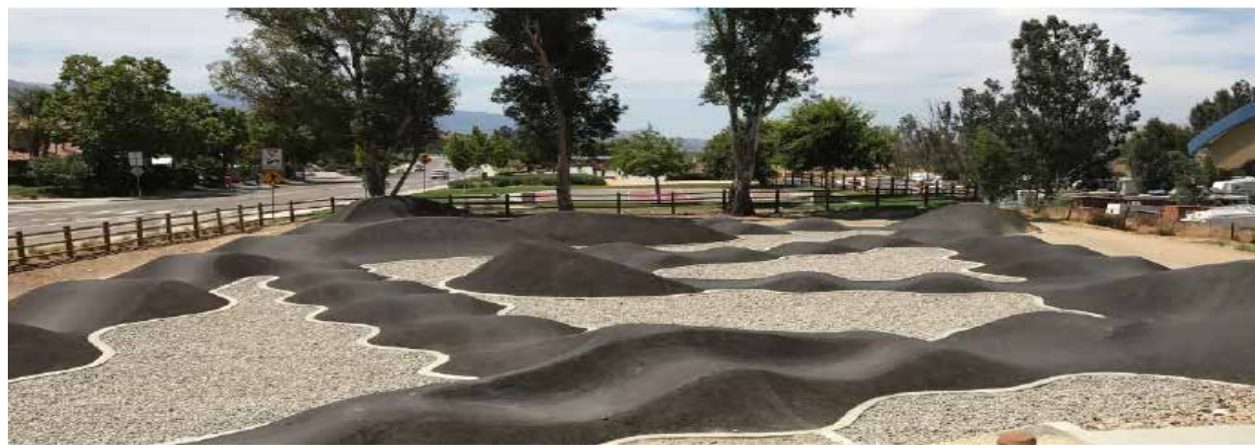
ASPHALT PUMP TRACK