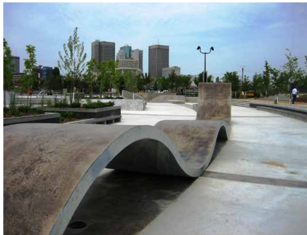
STREET COURSE - RAILS, MANUAL PADS, MAGIC CARPET