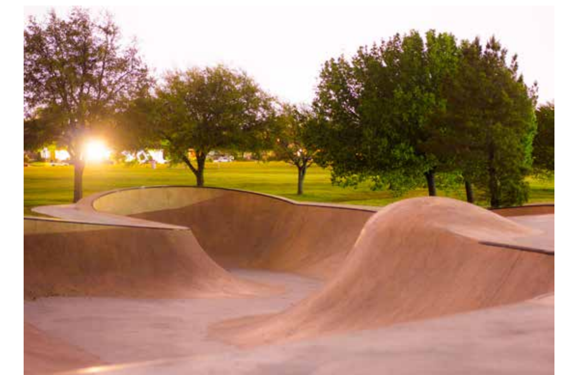
SNAKE RUN/FLOW BOWL