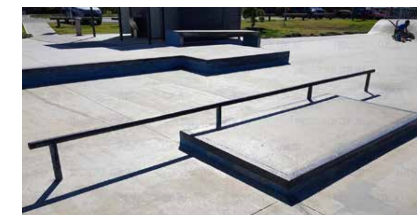
STREET COURSE - RAILS, MANUAL PADS, MAGIC CARPET