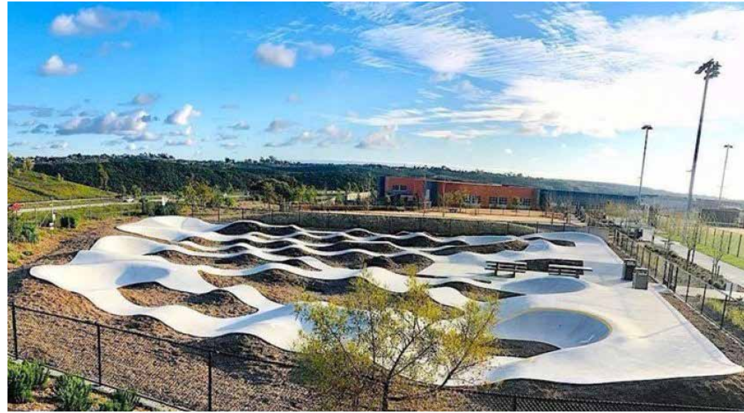
CONCRETE PUMP TRACK

Preliminary Skatepark and Pump Track Concept Plan Option 2B