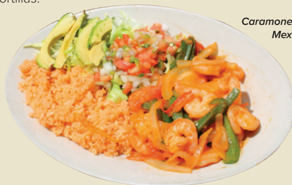
Camarones a la Mexicana

Camarones a la Mexicana 14.50 Shrimp grilled with onions, tomatoes and jalapeño peppers. Served with rice, lettuce, pico de gallo, avocados and flour tortillas.