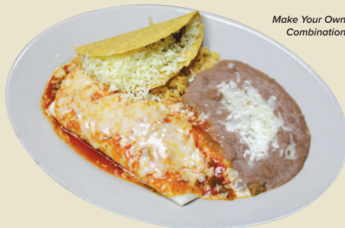
Make Your Own Combination