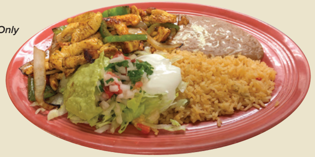
Lunch Only Fajitas