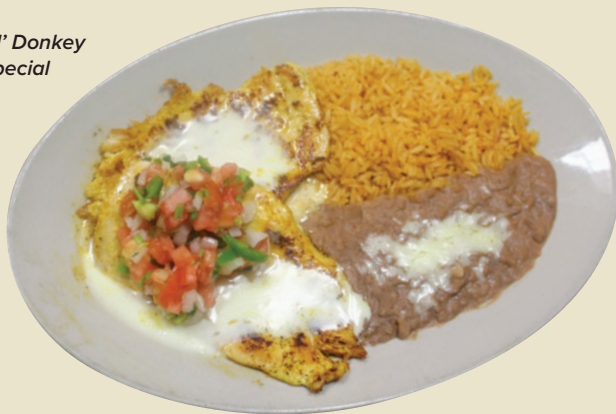
Lil' Donkey Special

Chicken Soup 8.99 Served with pico de gallo, avocado and rice.