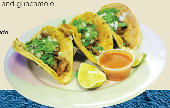
Tacos de Carne Asada

Quesadilla Alameda 11.99 Our cheese Quesadilla, stuffed with bell peppers, onions, broccoli, mushrooms and tomatoes covered with melted cheese; served with your choice of rice or beans and lettuce, tomatoes and guacamole.